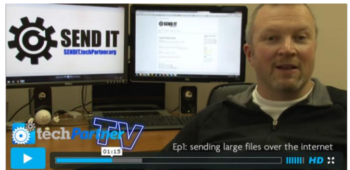
techPartner TV – Episode 1 – How to send large files over the internet

I would like to introduce you to sendit.techpartner.org . As a registered user you can send two large files at a time up to 250mb each. You choose your recipients' email and upload your files and away it goes. They will receive an email with a link to the file. Your file will be removed after several days for security purposes. This tool is contained 100% on our server and it intended to provide confidence while entrusting us with your files. All this is a free service of techPartner.